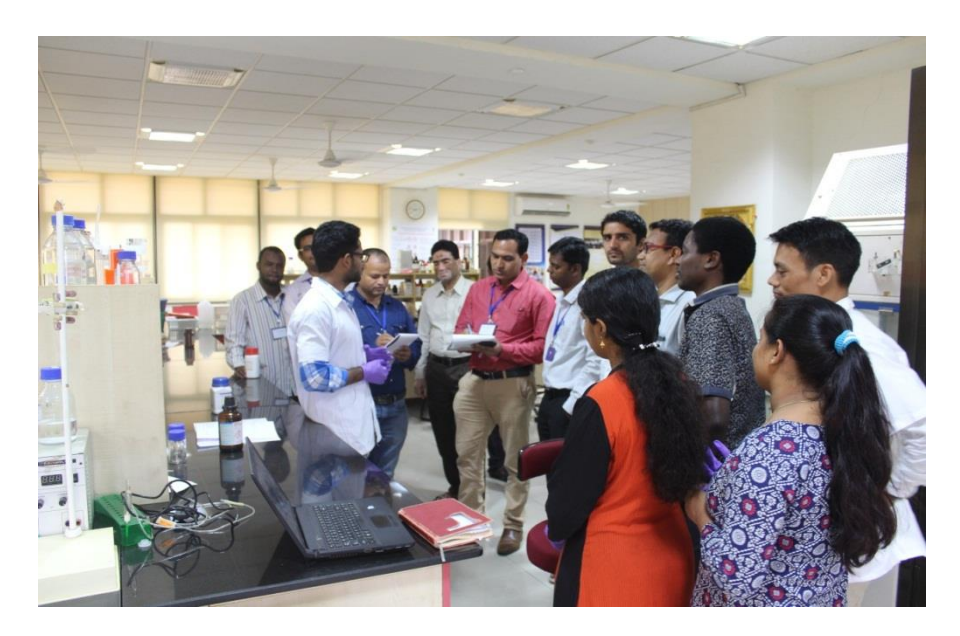
Practical session on nanoparticle synthesis