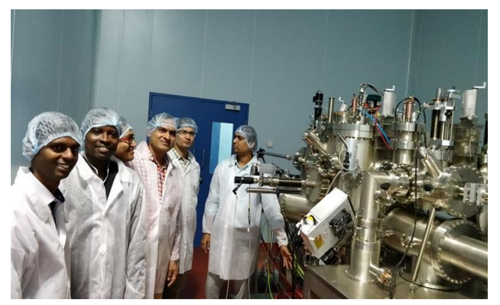
Visit to Nano centre of University of Mumbai